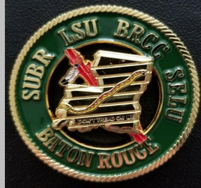
Unit Coin (back)