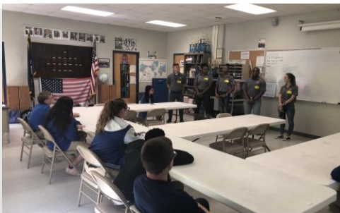
(Above: MIDN 2/C White speaks to NJROTC Cadets)