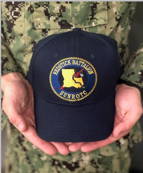
Unit Ball Cap