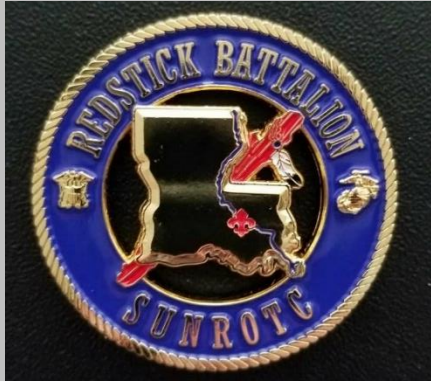
Unit Coin (front)

The Redstick Battalion has some exciting new products that will soon be made available for purchase. Purchase forms will be sent out soon so please consider an item below to show your support and unit pride!